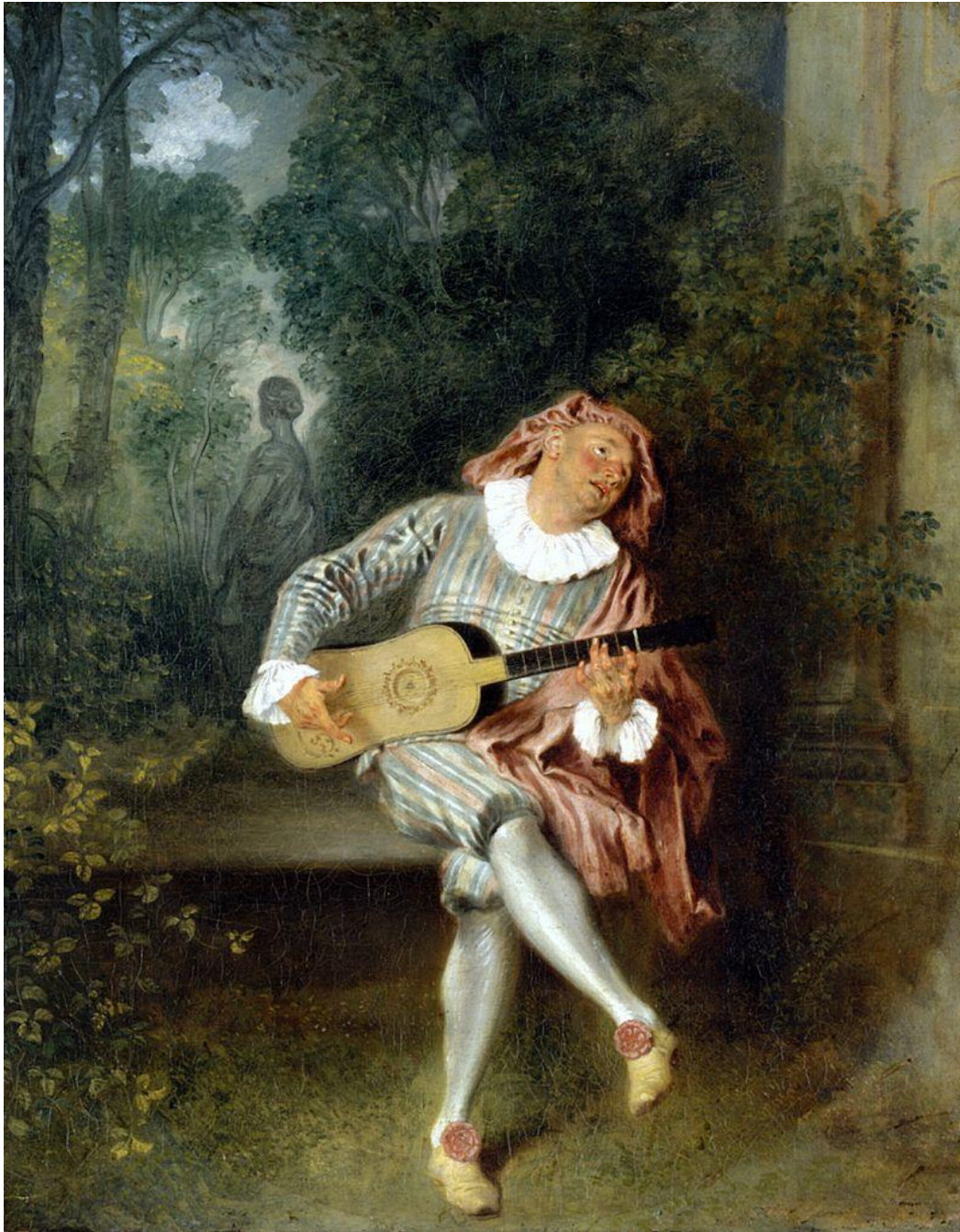
Debussy: Masques (5.5 mins) Mezzetin – Jean-Antoine Watteau